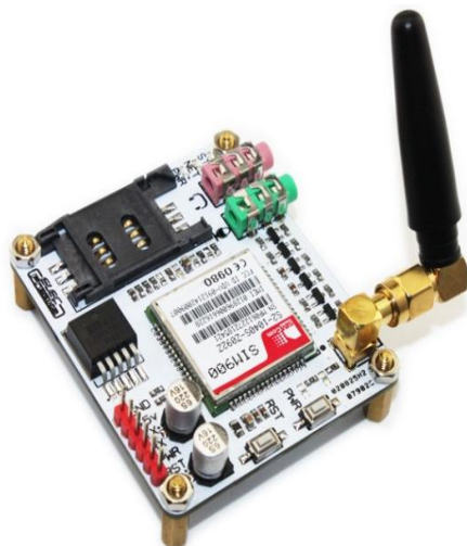
Fig1. GPRS Module.

The arm7 processor describes a family of RISC architecture. RM processors need significantly fewer transistors than processors that would typically be establish in a traditional computer. The benefits of this approach are lower costs, less heat, and less power usage, traits that are desirable for use in light, battery-powered devices and tablet computers. PIC is a family of modified Harvard architecture microcontrollers developed by Microchip Technology, derived from the PIC1650 originally developed by General Instrument's Microelectronics Division. The name PIC referred to "Peripheral Interface Controller" Peripheral interface controller is the most powerful microcontroller which is a 40pin device which is used as RISC architecture. One advantage of reduced instruction set computers is that they can execute their instructions very fast because the instructions are so simple. Another, likely more important advantage, is that RISC chips need fewer transistors, which makes them cheaper to design and produce.